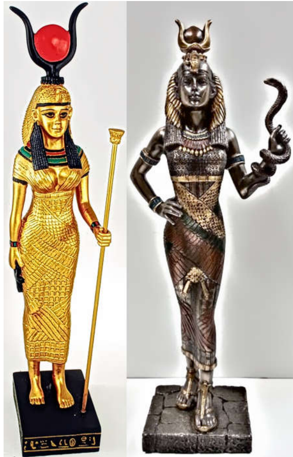
Figure 2: Two Hathors available online

Once you have your statue, wrap it up in cloth and store it away until you are ready to work on it. Do not leave an empty vessel around a magical household while you are waiting to start the work: by now you should know what problems this can invite.