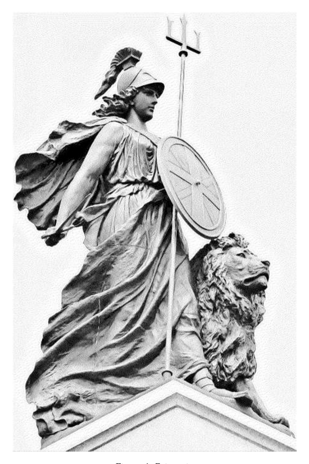
Figure 1: Brigantia

magical vocabulary for seership/prophecy in the future (left). We know that she worked with Dee to foresee what was ahead, which this imagery confirms. She has the eyes and ears of the angelic powers protecting her, and her prophecy/seership warns her of what lay ahead.