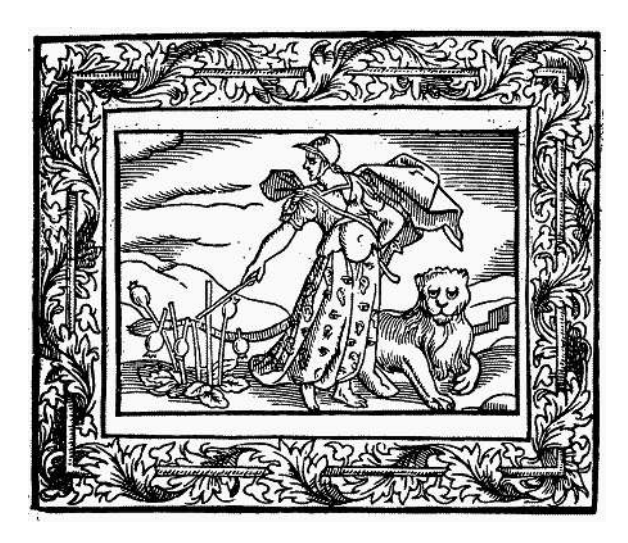
Figure 4: From p.22 of the Minerva Britanna of Henry Peacham, from the page dedicated to Julius Caesar.

the king), and note the cutting of heads off poppies. The poppy-cutting imagery is drawn from the writings of Titus Livius's Ab Urbe Condita Libri (Livy's Histories of Rome ). Livy writes about Tarquin (Lucius Tarquinius Superbus), the last king of Rome who died in 495 B.C..