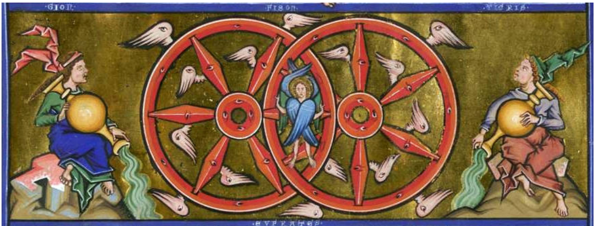
Figure 2: Thirteenth-century Ophanim

As the Wheels can facilitate an ‘up’ movement of power and angelic structure, so they can also facilitate a ‘down’ movement. The Four Creatures are depicted with wings, which is also the visual vocabulary for ‘up,’ and they bear the faces of four sacred creatures.