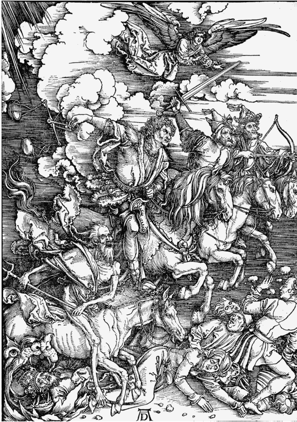
Figure 4: Albrecht Dürer, The Four Horsemen

The next image is from a totally different culture and religious pattern, Buddhism, and is one of the Cakravarti. The image is of a mandala that depicts the Chakraratnaya or Great Wheel, one of the seven miracle treasures, a great wheel that spins in the sky.