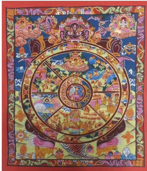
Figure 6: Klacakra wheel of life

So maybe now you are beginning to understand why awareness of these Wheels is a major key for the adept in a whole layer of understanding.