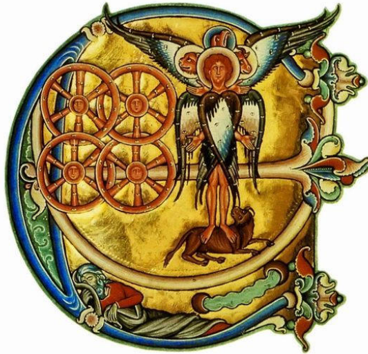
Figure 3: Medieval version

While these depictions change according to culture and artistic license, the underlying imagery has its roots in the visionary encounters of humans with these beings—and once you spot them in vision, you will never forget them.