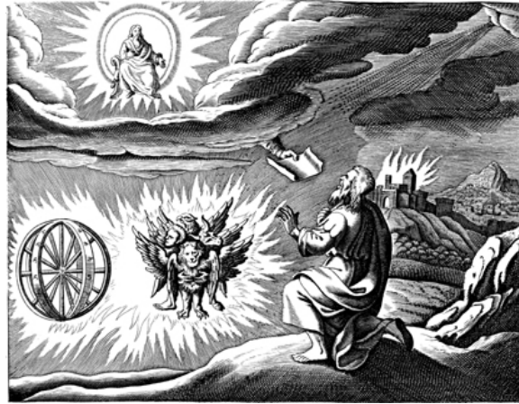
Figure 1: Engraved illustration of the “chariot vision” of the Biblical book of Ezekiel, chapter 1, after an earlier illustration by Matthaeus—Matthäus—Merian—1593-1650—for his “Icones Biblicae”—a.k.a. “Iconum Biblicarum”).