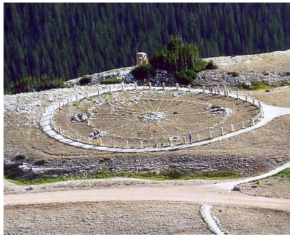
Figure 7: Medicine wheel Wyoming

know when they were built or what they were used for, and though many theories proliferate, in the end they are just theories. But I thought it pertinent to show you one of these Wheels. This one is in Wyoming, and is situated at the top of Medicine Mountain in the Bighorn Mountains. It stands at 9,420 feet and when I visited it in the middle of summer it was snowing. I had one of my most profound experiences there, and it was totally unexpected. It gave me a great deal of respect for those who built it and the deep, lasting power gathered together in that place. No one knows how old it is, but there is evidence of activity there for at least seven thousand years.