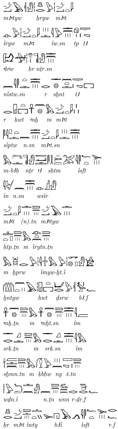
Figure 1: Book of Gates , 7th hour, 43rd scene