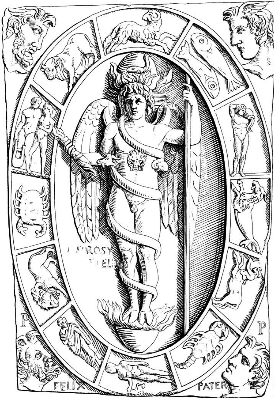
Figure 4: Phanes , engraving by Arthur Bernard Cook, 1914