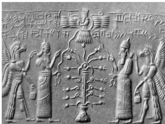
Figure 5: Sumerian Pomegranate