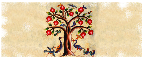
Figure 6: Pomegranate tree