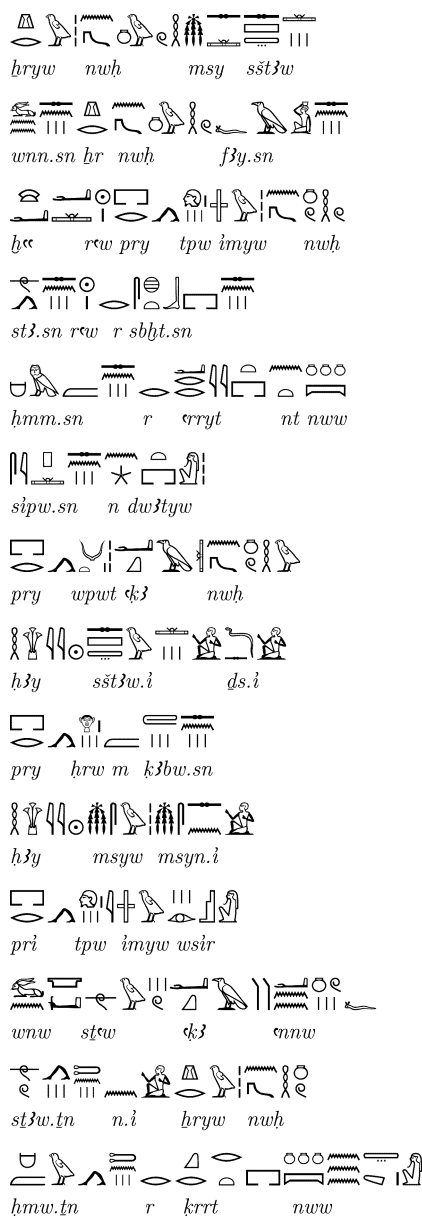
Figure 2: Book of Gates , 8th hour, 48th scene