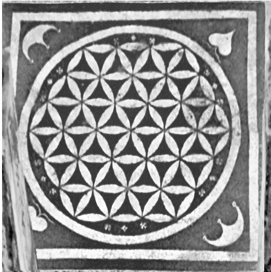
Figure 1: Flower of Life at Ephesus, Turkey

and mysticism: often you see ancient, powerful images, and the site's author knows there is a Mystery behind them, but they do not actually know what that Mystery is.